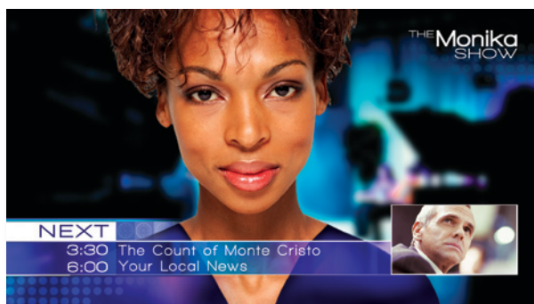
Program schedule graphics can be enhanced with previews of the upcoming programming

Imagestore Intuition+ greatly extends the animation playout performance of Imagestore family processors, and adds a versatile video/audio clip playout capability. It's ideal for the most complex, multi-level promotional and channel branding graphics.