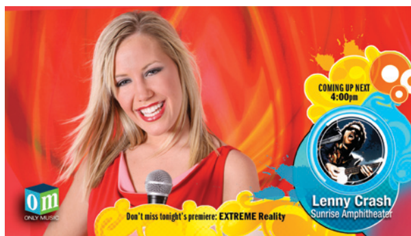
Music channel presentation enhanced with animated lower third and logo graphics