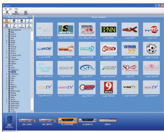
Xmedia Suite offers easy template preparation, data interfacing and distribution