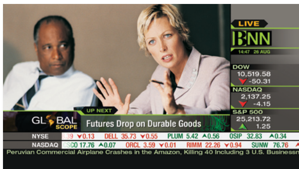
Financial television templates can be created with full control of text dynamics