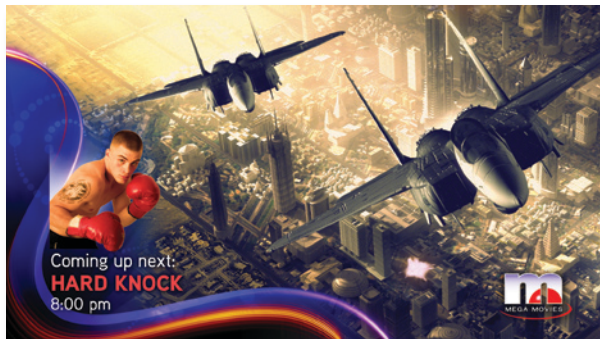
Embedded templates enable graphics professionals to focus on design, without having to worry about traditional automation constraints

The advanced HD/SD character generator option for Imagestore Intuition+ provides template-based, multi-level graphics, with an almost infinite number of layers of crawls, rolls and 'dynamic' static text.