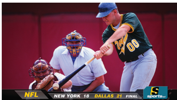
Imagestore Intuition+ is ideal for sports channels which demand interfacing to proprietary sports news feeds