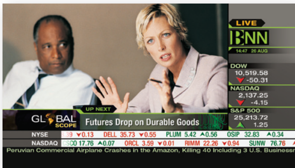
Complex, data-driven graphics with multiple layers of animated and dynamic text