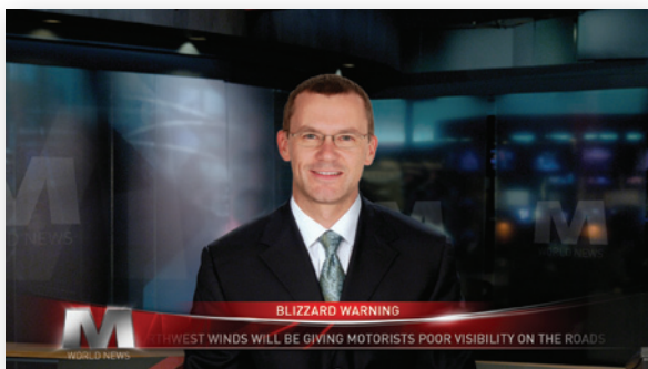
EAS message insertion with high quality text