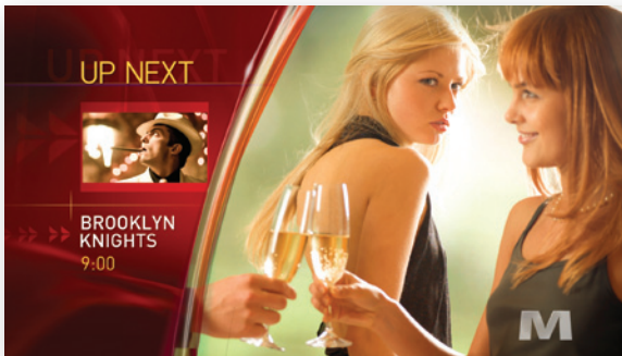
Vertigo XG is ideal for highly animated 'Coming up next' graphics