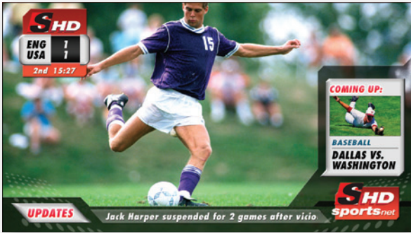
Playout of one or more clips allows creation of advanced promotional graphics effects

Vertigo XG provides all the playout capabilities needed for the most advanced branding and promotional graphics: