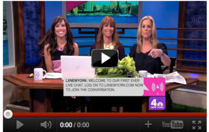
Watch our Twitter graphics system in action at WNBC

Templates for rich and highly animated, social media and channel branding graphics can be quickly prepared, with full integration across Miranda's Vertigo Suite graphics automation tools and Quest's software solutions for local stations. The system allows the full mix of channel branding and promotional graphics to be played out, including lower thirds, junctions, and schedule boards.