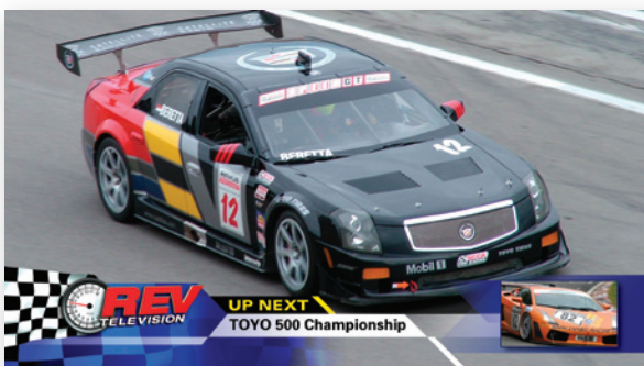
A dual channel DVE is ideal for squeeze back and picture-in-picture effects