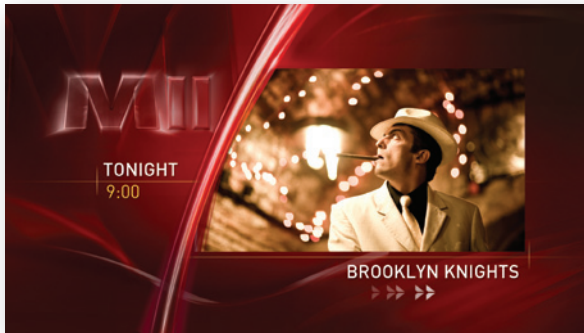
Advanced multi-level HD/SD character generation with full TrueType / Unicode character support